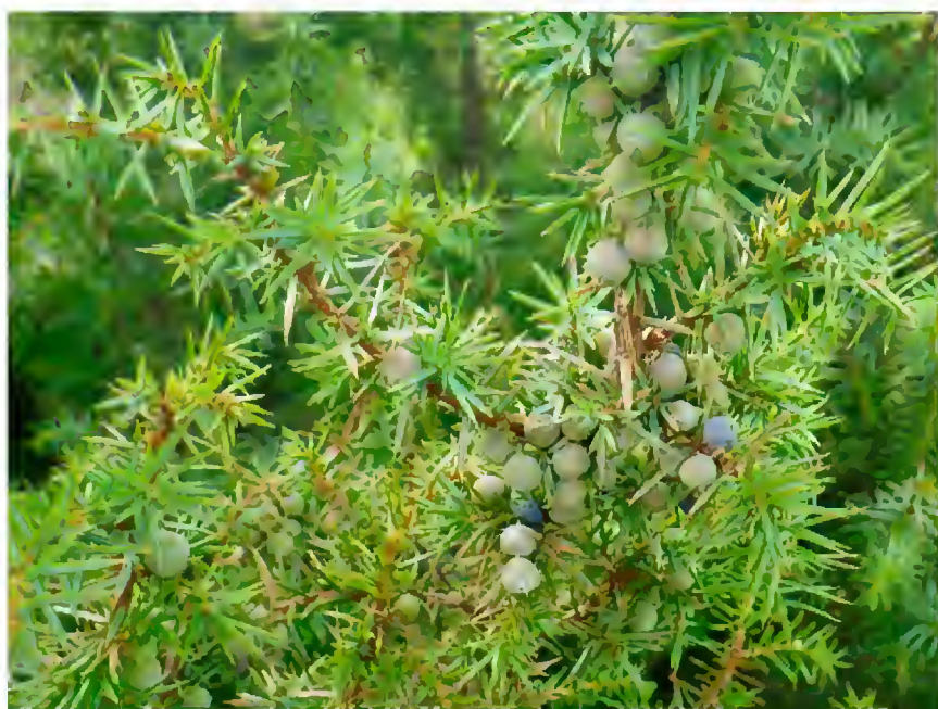
Fig. 5. v. communis , close-up, Otter Creek, WV.